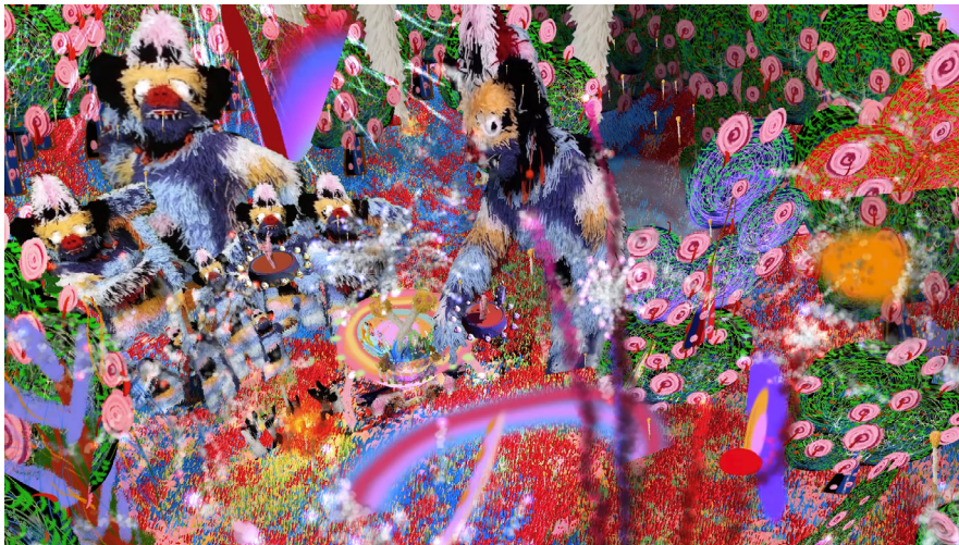
WANG Chen. The Sin Park . 2019. Video still.

I am still scared, but I am now philosophical about it. The fear has not dissolved but has settled at the bottom of daily reality. TIAB was originally designed with ‘emergency’ in mind, calling upon the idea of the immigrant mindset, which is typically set to fight or flight