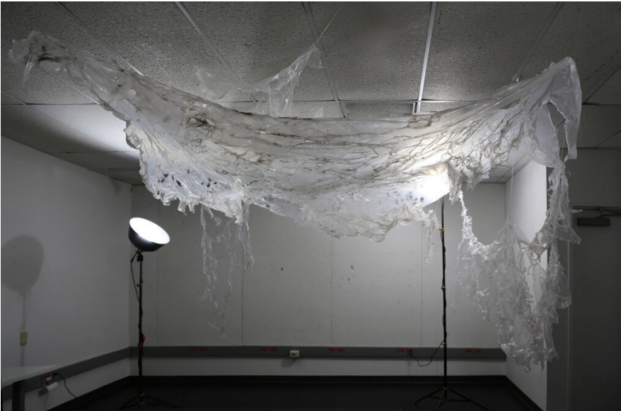
Abena Motaboli. The Pieces that hang far up above - in you, in me, in I, in We, in Us. 2019. Plastic Tarp. Dimensions variable approximate 12ft x 12ft x 12ft.

Someone once told me that in the hesitation of being, we were. Car nous sommes ou nous sommes pas And as I sat - the immigrant - I thought Here were all the things I was ever inspired by The condition of the here, the now, the memory and the being Car nous sommes ou nous sommes pas